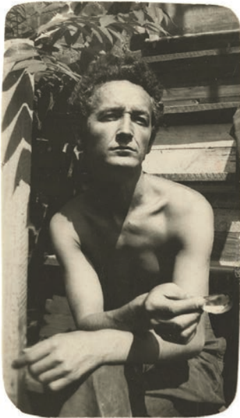
Woody Guthrie on Mermaid Avenue in Coney Island in 1950 (above); narrator Will Patton in the studio